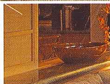
SLIDING PANELS HELP SCREEN THE KITCHEN.

Send before-and-after shots, along with a SASE, to Room for Improvement, Seattle Homes & Lifestyles , 1221 E. Pike St., Suite 305, Seattle, WA 98122.