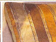
PILLOWS LEND COLOR, PATTERN AND TEXTURE.